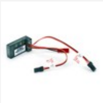
3-in-1 Control Unit, Mixer/ESCs/Gyro:BCX2 (EFLH1023)