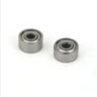
Bearing 2 x 6 x 3mm (2): BCP, BCX/2/3 (EFLH1121)

E-flite bearing for the Blade CP and the inner shaft bearing for the Blade CX, CX2 and CX3.