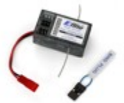
4-in-1 Control Unit, Rx/ESC/Mixer/Gyro 2.4GHz:BCX2/3 (EFLH1024)