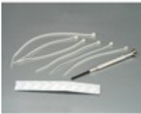
Mounting Accessories & Screwdriver (EFLH1209)

E-flite bearing for the Blade CP and the inner shaft bearing for the Blade CX, CX2 and CX3.