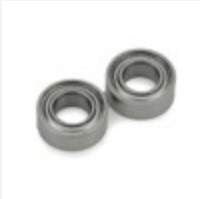
Bearing 4 x 8 x 3mm (2): BCX/2/3, BSR (EFLH1215)

E-flite inner and outer shaft retaining collars for the Blade CX, CX2 and CX3