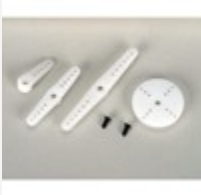
Standard Arm Set, Fine Spline: S60, DS75 (EFLRSA100)