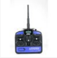
LP5DSM 5-Channel Transmitter, 2.4GHz: BCX2/3 (EFLH1055)