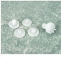
Gear Set: S60 (EFLRS601)