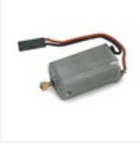
180 Motor with 8 Teeth 0.5M Pinion Right: BCX/2/3 (EFLH1211)