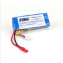
800mAh 2S 7.4V 10C LiPo, 20AWG JST/Balance (EFLB0990)