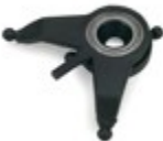
Swashplate Set: BCX/2/3 (EFLH1216)

E-flite outer shaft bearings for the Blade CX, CX2 and CX3; also the Main Shaft bearings for the Blade SR