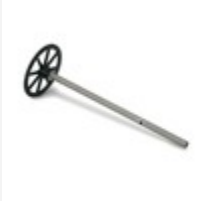
Outer Shaft and Main Gear Set: BCX/2/3 (EFLH1213)

E-flite 180 Motor with 8 tooth 0.5M Pinion installed and a PTC (Positive Temperature Coefficient) fuse for the Blade CX, CX2 and CX3.