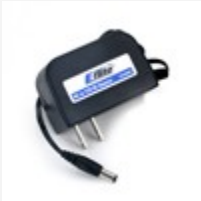
AC to 12VDC, 1.5 Amp Power Supply (EFLC4000)