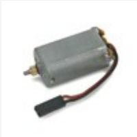
180 Motor with 8 Tooth 0.5M Pinion Left: BCX/2/3 (EFLH1210)

Zip Ties and Double Sided Tape to keep wires and electronics from bouncing around. Screwdriver included for those small screws on the Blade CX, CX2, CX3, mCX, mSR, and mCX Tandem Rescue.