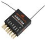
AR6110e DSM2ML6ChRxEndPin, Park Flyer Air (SPMAR6110E)

Spektrum's 2.4GHz DSM2 Technology gets even smaller with the AR6110e 6-channel DSM2 Microlite Park Flyer Receiver with End Pins