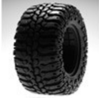
Fr/R A/T Truck Tires with Foam, Blue (2)