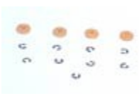
Shock Pistons #55, Orange (4)