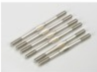
Left/Right Turnbuckle Set (6): Speed-T, SNT