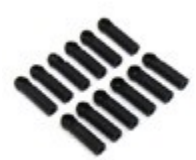
Plastic Ball Cups (12): Sport RTR, SPT