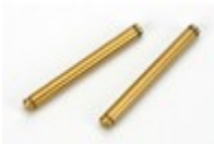
Hinge Pins,(2) 3/32 x .930" Ti-Nitride